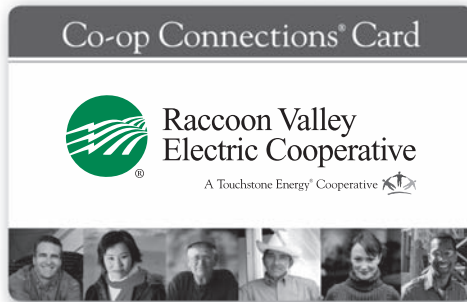
RVEC members have saved over $1,044.28. See how much you can save!

The Co-op Connections Card is FREE - and just another of the many benefits of being a cooperative member!