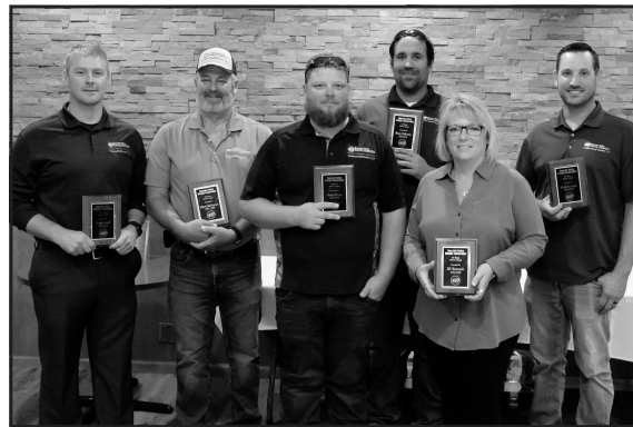
Thank you for all you do!