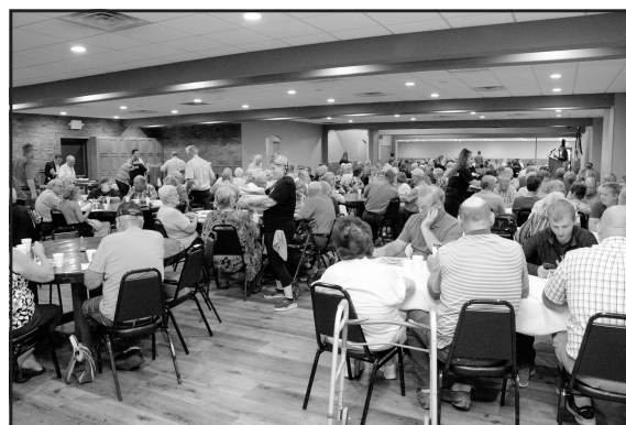
RVEC member-owners enjoying their meal.